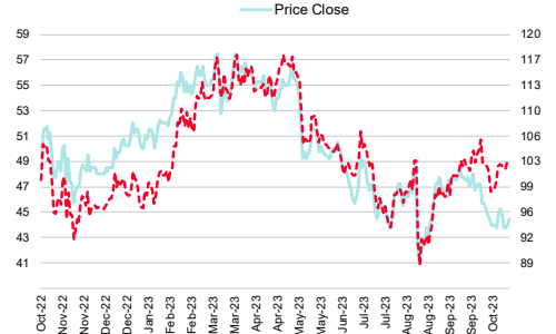
Central Plaza Hotel (CENTEL TB)